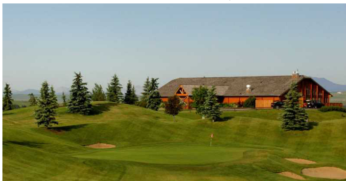
Located only a few minutes outside of Calgary, Alberta